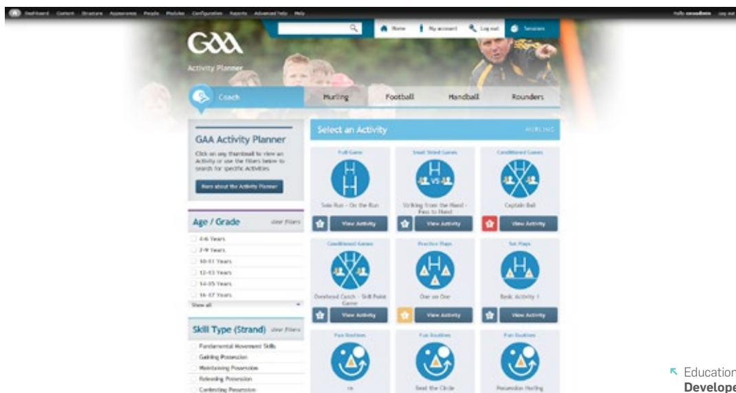
Education portal Developed for GAA

Underpinning our product suite is our team of experts who provide professional support to meet the needs of our customers. In many cases the solutions we provide our clients are more than e-Learning systems but complete education management portals comprising integrated content management[Drupal], e-Learning[Moodle+] and ePortfolio functionality. This breadth of technical expertise will enable us to roll-out advances in Moodle search capability using the SOLR enterprise search platform.